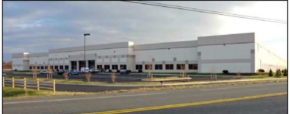
Building A - 672,000 S.F. • 511 Chelsea Road

2,056,400 S.F. warehouse/distribution complex Perryman, Harford County, Maryland See the property website at: www.m-adc.com